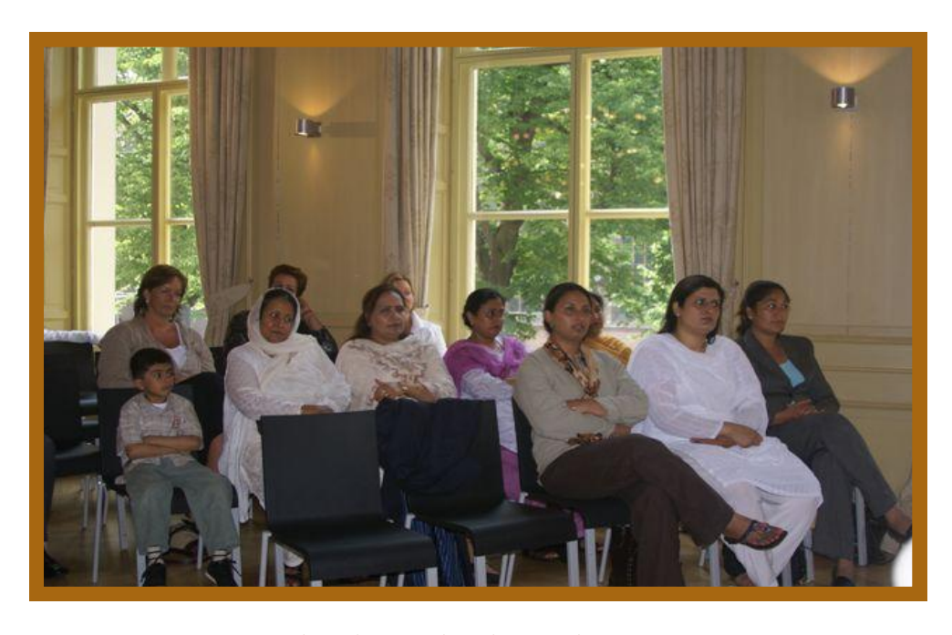
The audience at the Diligentia Theater